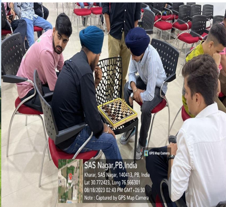
(Games: Chess, volleyball)